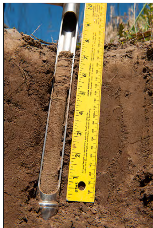
Figure 4. Measuring sampling depth.