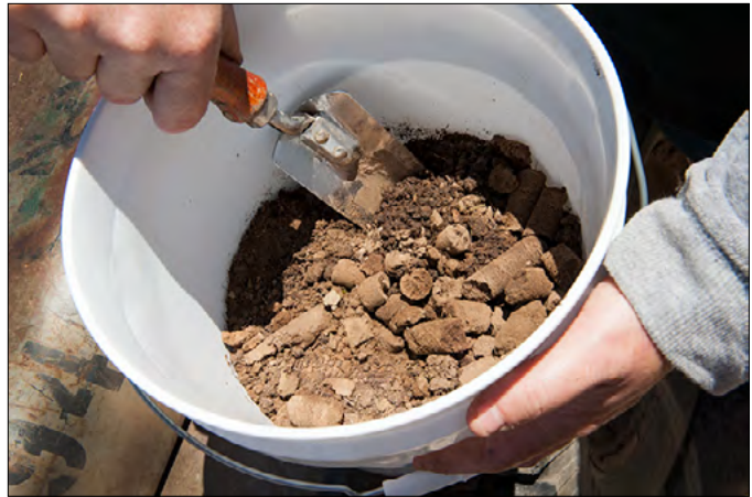
Figure 5. Use a clean hand tool to mix the subsamples.