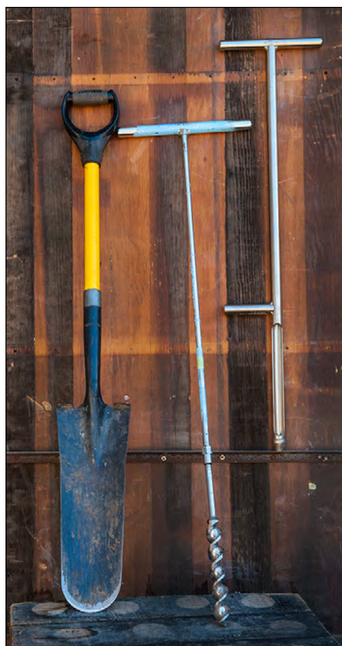
Figure 3. Soil sampling tools.