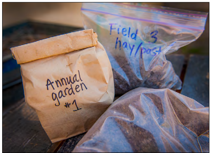
Figure 6. Take a photo of your sample bags before you mail them, for future reference. Do not use a paper bag unless the lab provides one lined with plastic.